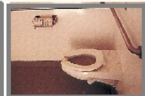
ABOVE: concealed flush type toilet fixture. LEFT: Typical toilet partition.